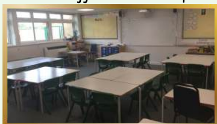
I will come in this door

This will be my classroom. It might look a little different in September.